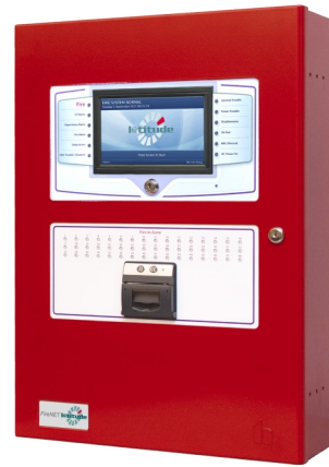
Double Aperture Includes Zone LED Module and Printer